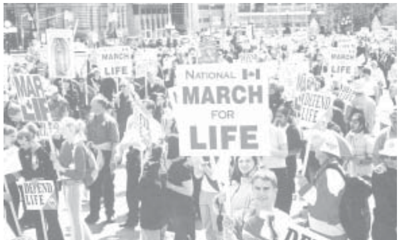
Over 3500 Pro-life Marchers were in Ottawa this year for the March for Life. Over half of the crowd were youth! Twenty two M.P.'s as well as clergy, addressed the thousands gathered on the Hill. Many Knights of Columbus in full regalia also marched for life.