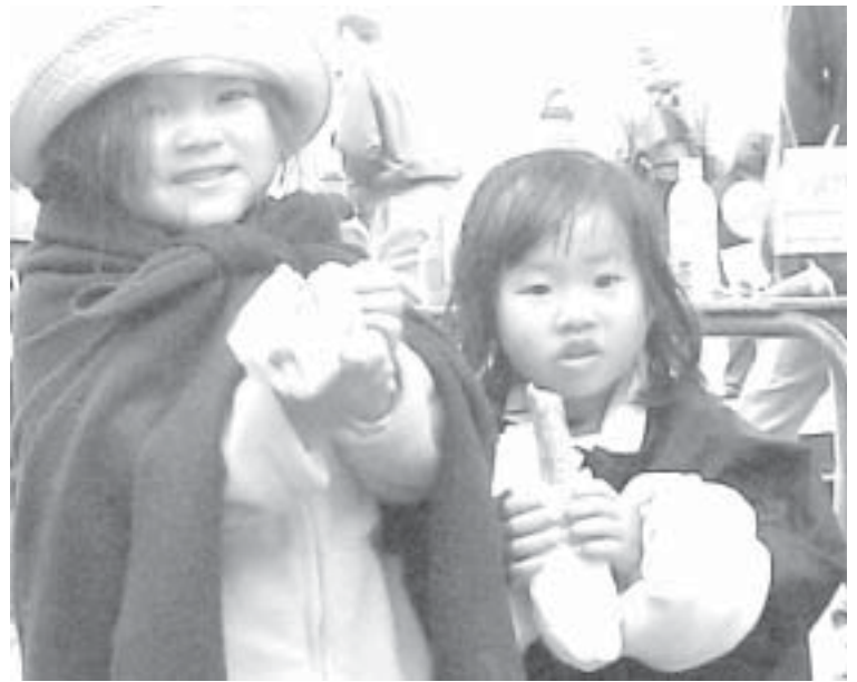
After the Walk charming Hot Dog Munchers

Kellogg Canada Inc. Nestles of Canada 100 Kellogg Lane, London 980 Wilton Grove Rd., London (519) 455-9660 (519) 686-0182