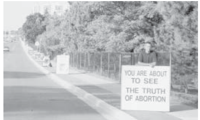
Show the Truth - Toronto 2003

"We have had a national debate on abortion for over 30 years. While abortion is the most common surgery in America, most Americans have never seen what it looks like. Once people do see it they can never forget."